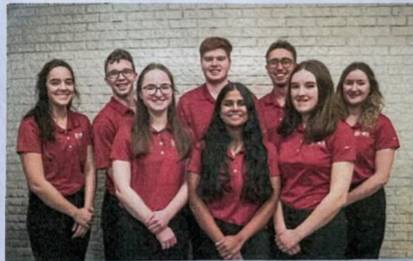
NET 2024 Traveling team